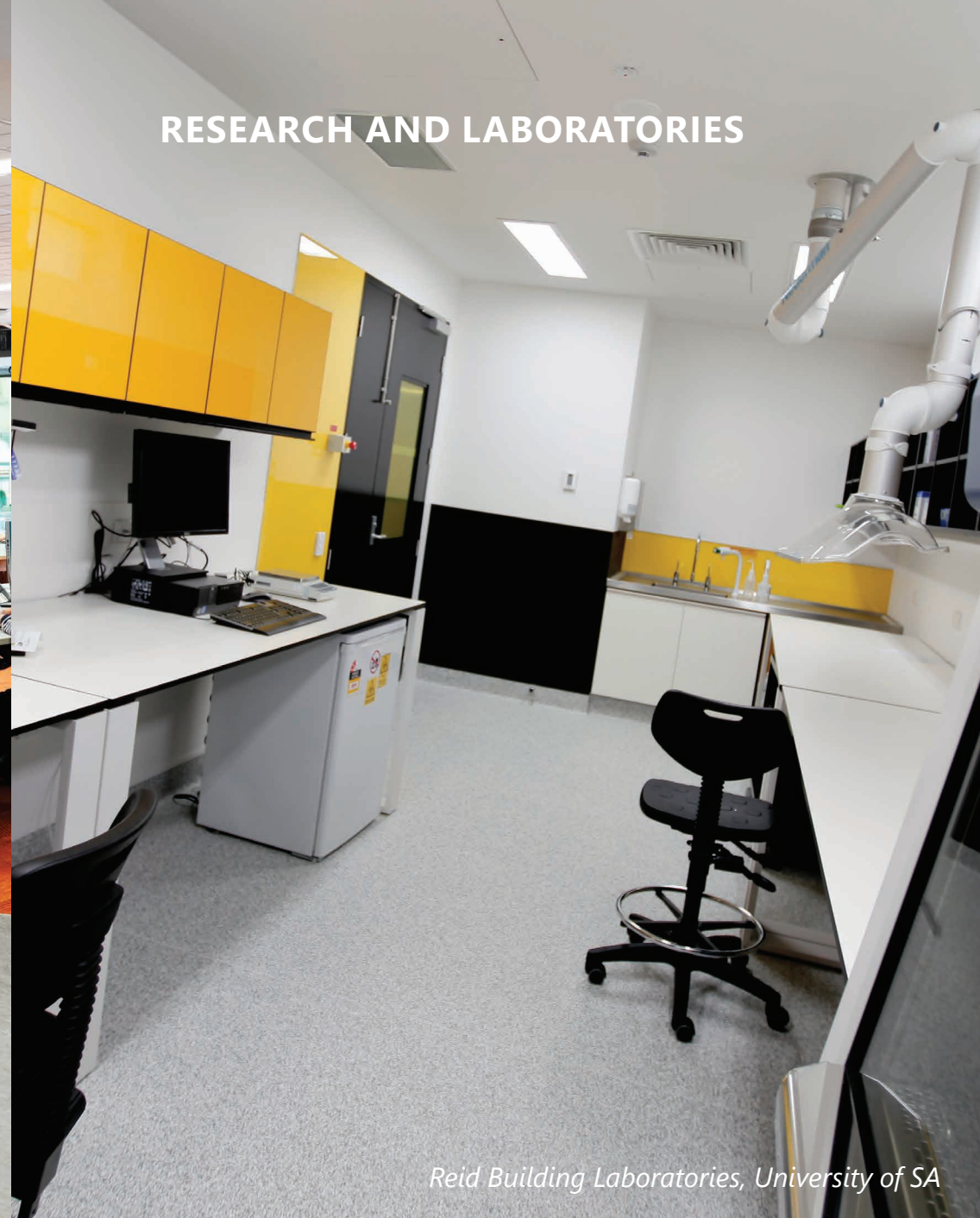
Reid Building Laboratories, University of SA