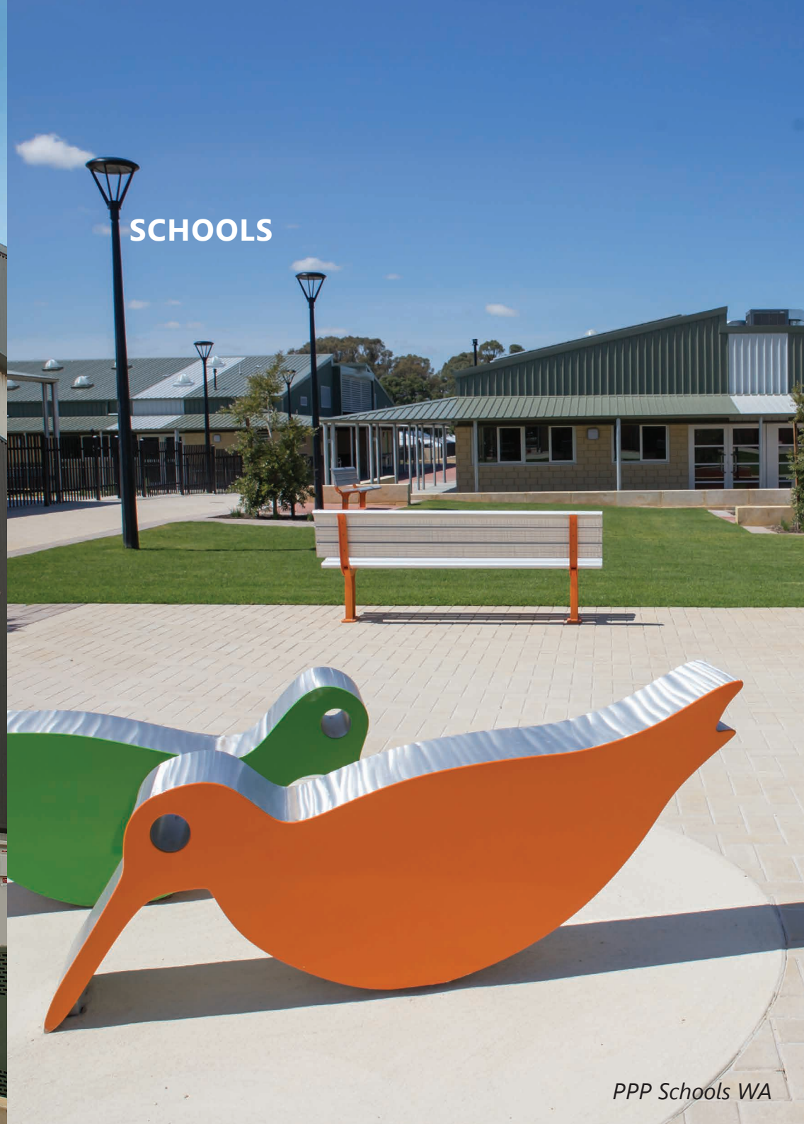
PPP Schools WA