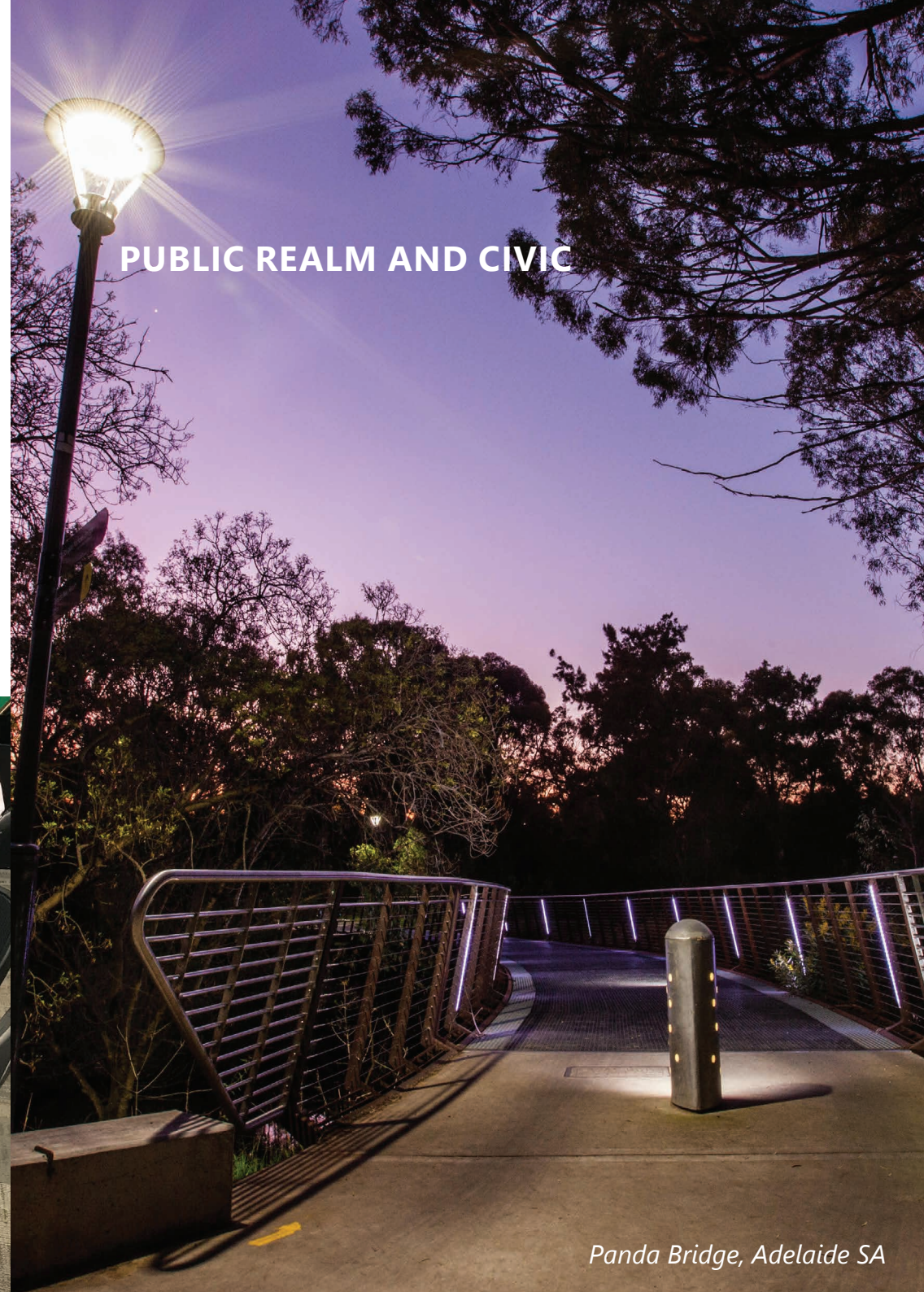
Panda Bridge, Adelaide SA