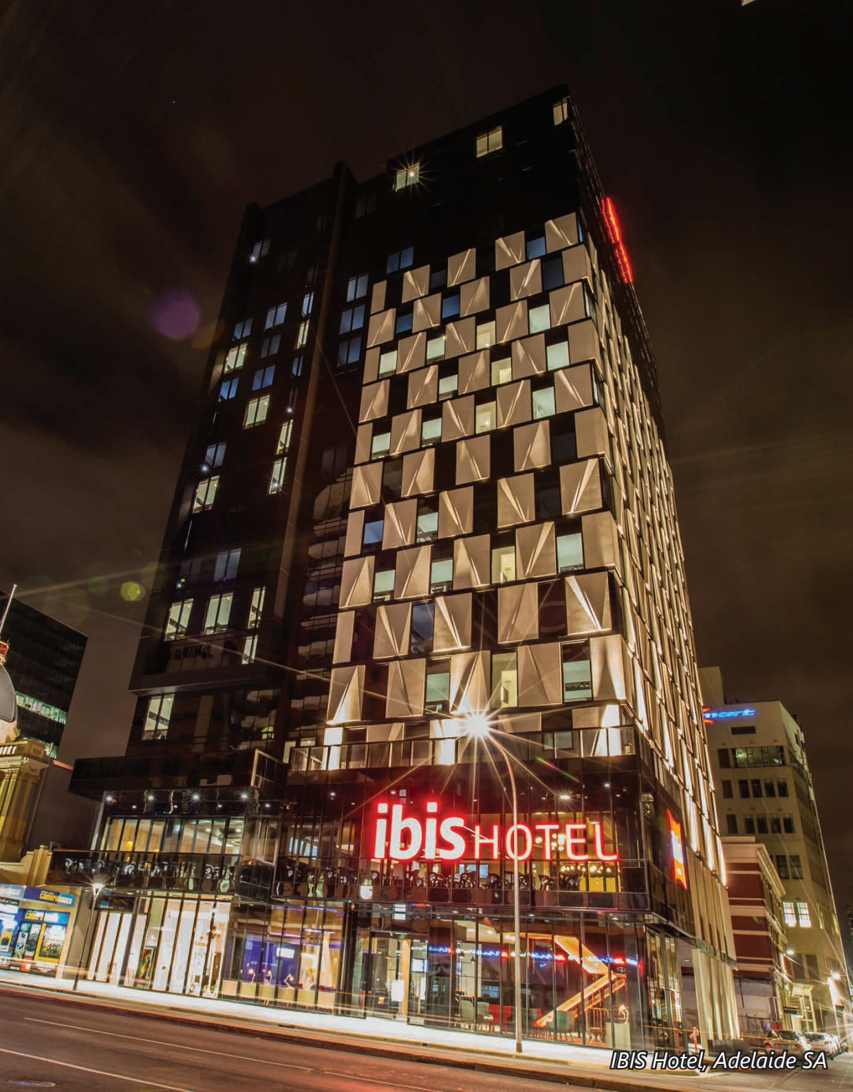
IBIS Hotel, Adelaide SA

We operate as one cohesive, national team to provide the following engineering and advisory consulting services: