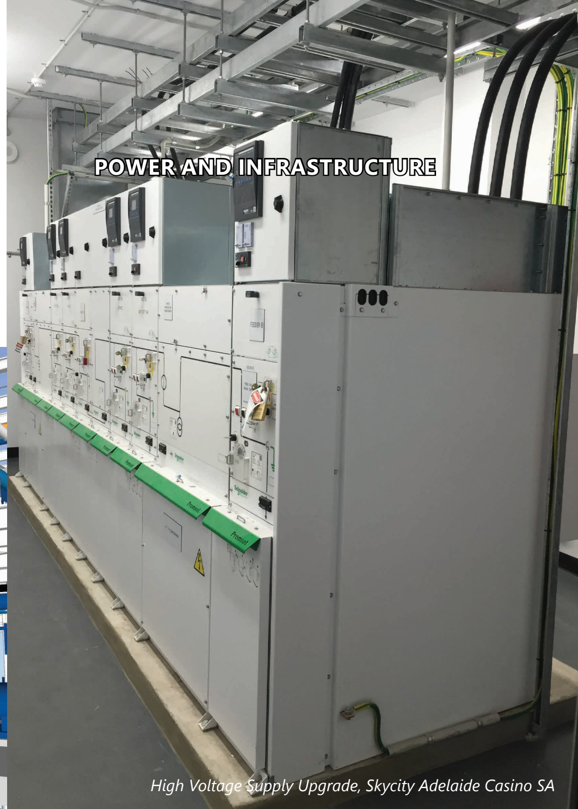
High Voltage Supply Upgrade, Skycity Adelaide Casino SA