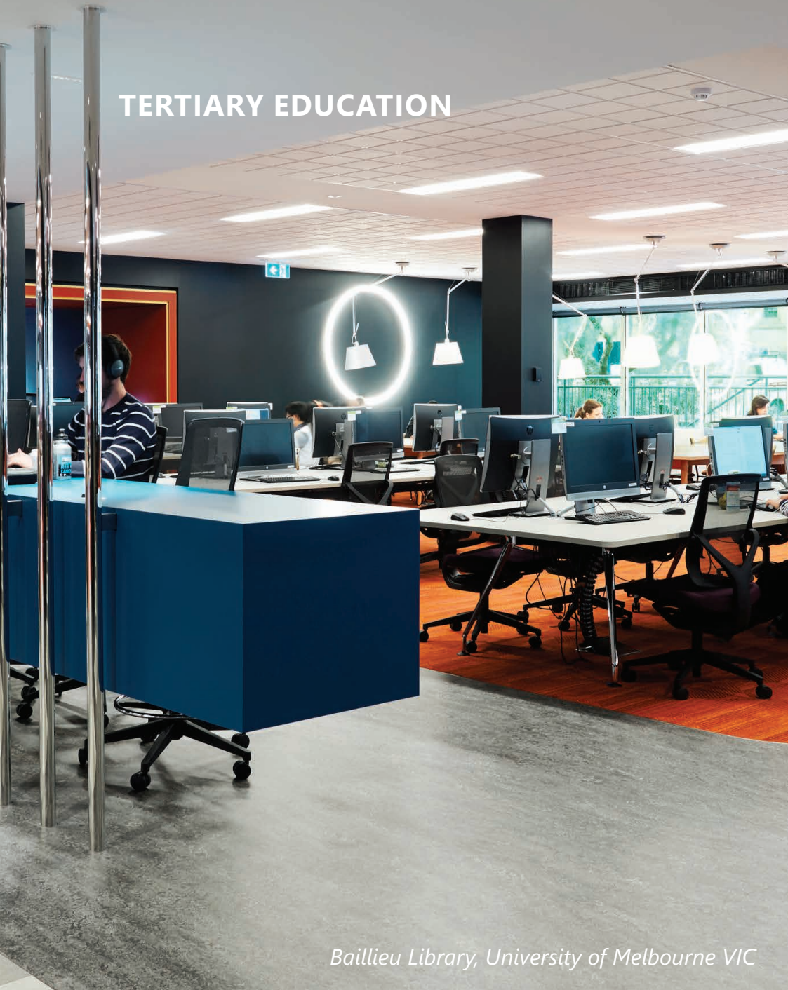
Baillieu Library, University of Melbourne VIC