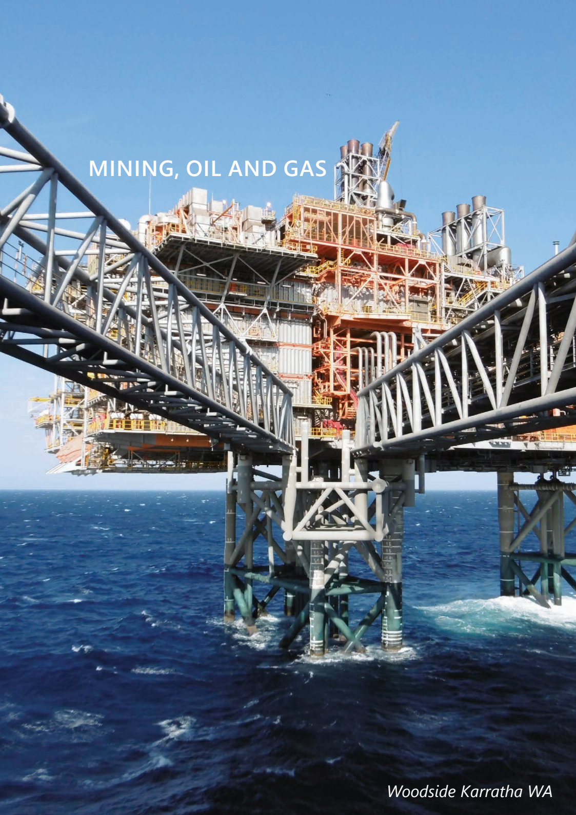
Woodside Karratha WA