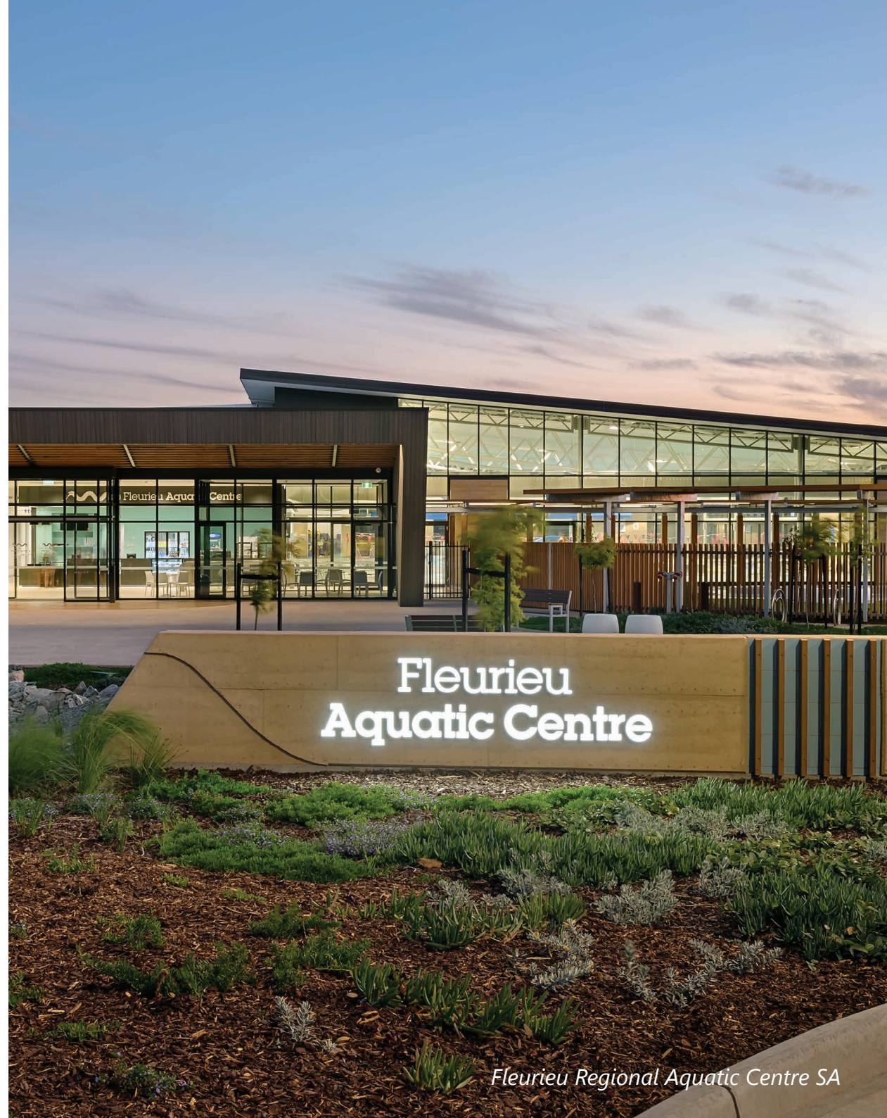
Fleurieu Regional Aquatic Centre SA

SPECIALIST ENGINEERING DESIGN AND ADVISORY