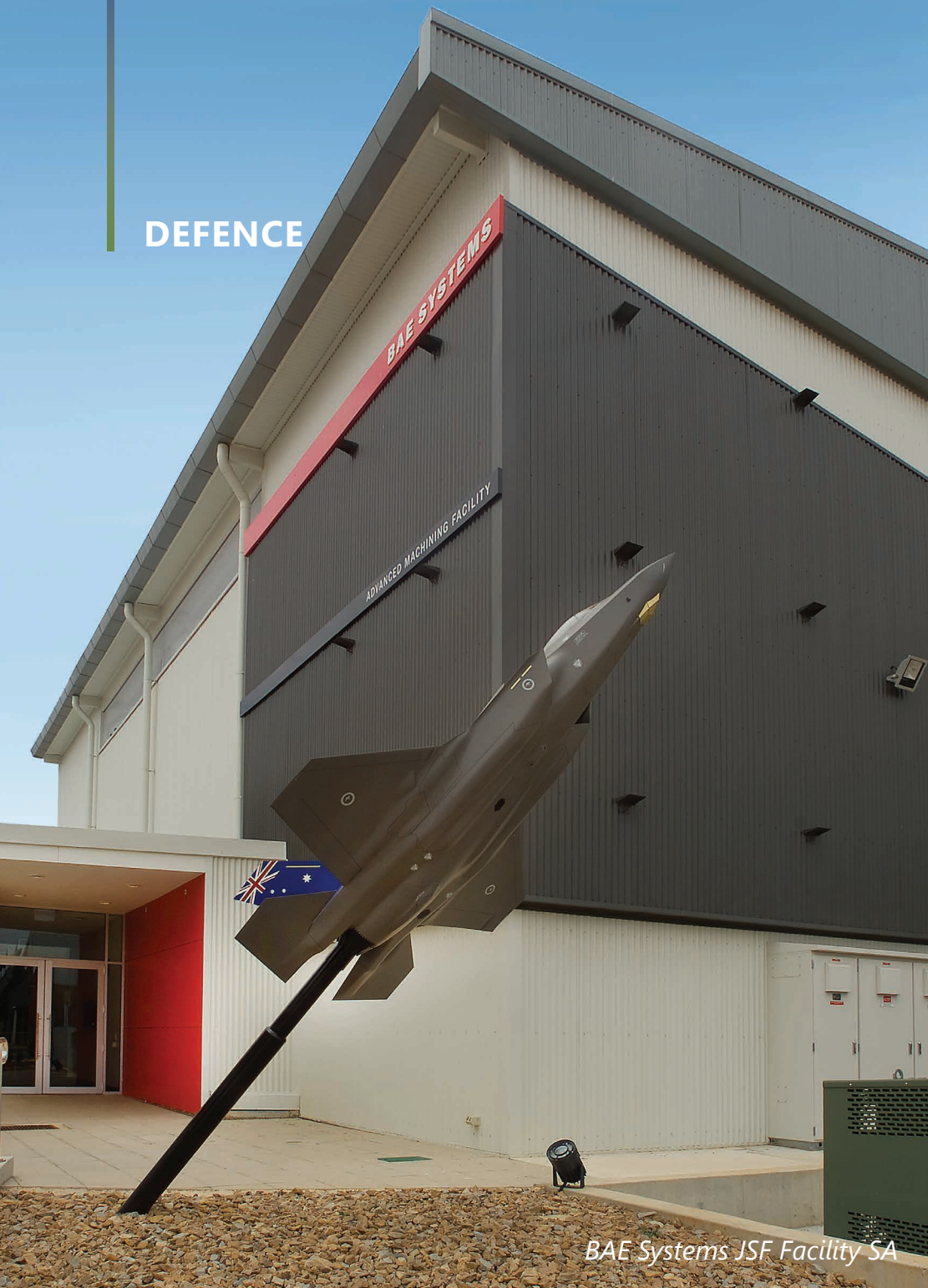
BAE Systems JSF Facility SA