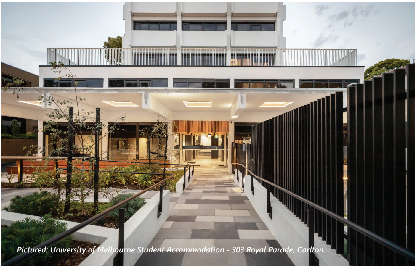
Pictured: University of Melbourne Student Accommodation - 303 Royal Parade, Carlton.

Please refer to the full series of Lucid NCC Section J 2019 technical notes for further discussion of the changes. If you require assistance on a specific project or have a general query related to NCC Section J 2019, please contact Lucid Consulting at the following address ( NCC2019SectionJ@lucidconsulting.com.au ) and a member of our Energy and Sustainability team will be in contact to assist you.