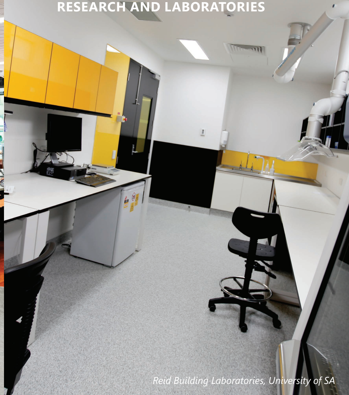
Reid Building Laboratories, University of SA