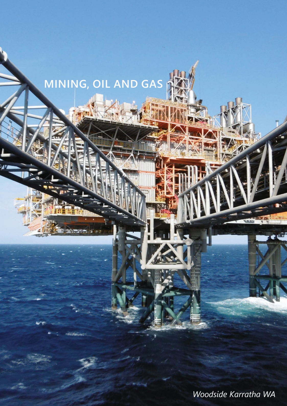
Woodside Karratha WA