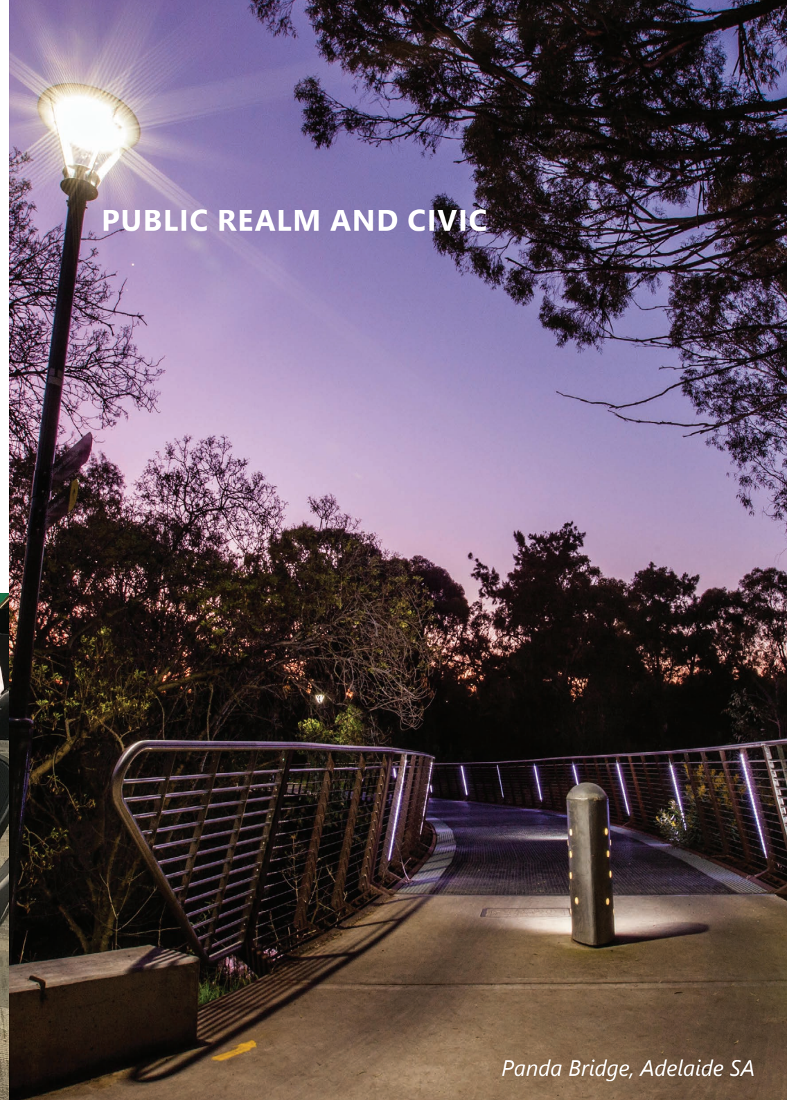
Panda Bridge, Adelaide SA