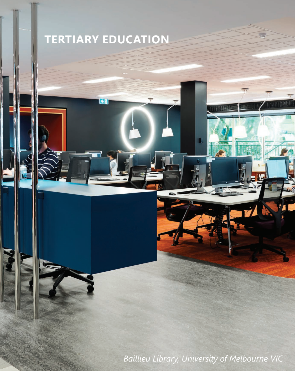
Baillieu Library, University of Melbourne VIC