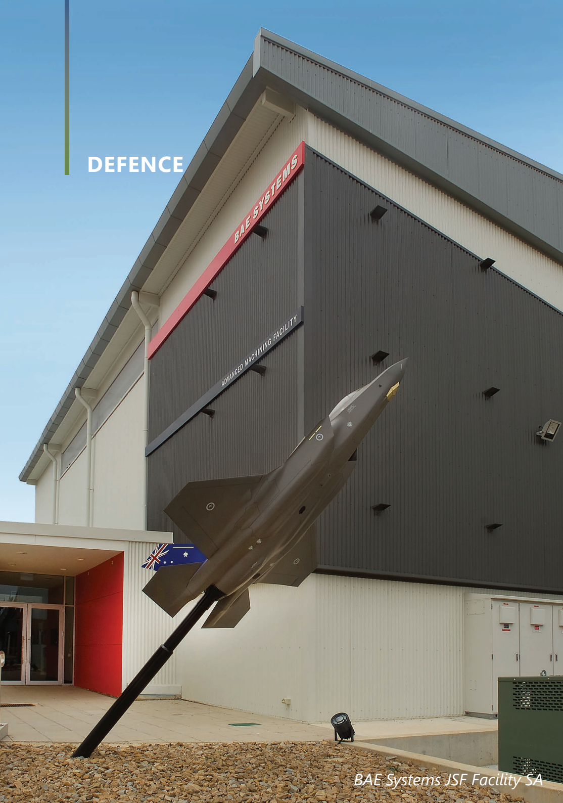
BAE Systems JSF Facility SA